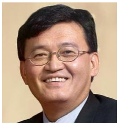
Lip-Bu Tan C.E.O., Cadence and Chairman of Walden International