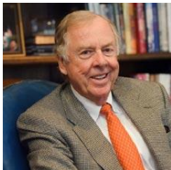
T. Boone Pickens Chairman, BP Capital